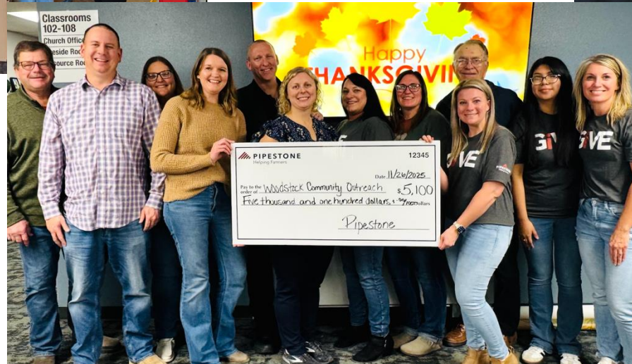
HR – Woodstock Community Outreach