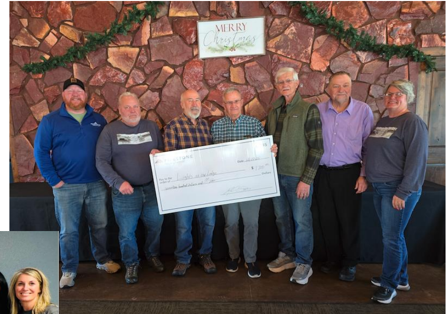
Transport – Lights at the Lodge

Our teams have been busy during this holiday season! Thanks to everyone that has participated in a GiVE event!