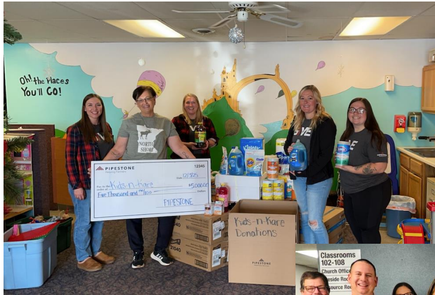
Warehouse - Kids-N-Kare